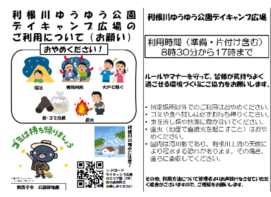
Rise enlightenment handbill of manners

A sign of available hours is installed in an entrance and exit way in a parking lot of the day camp square. A square concerned prohibits stay use, so please be careful.